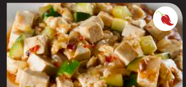
MA PO TOFU BEEF