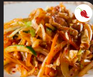
BEEF DONG FEN