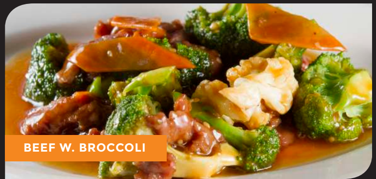
BEEF W. BROCCOLI