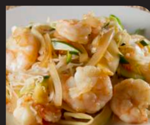
SHRIMP MEI FUN