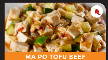
MA PO TOFU BEEF