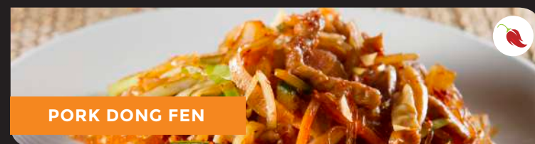
PORK DONG FEN