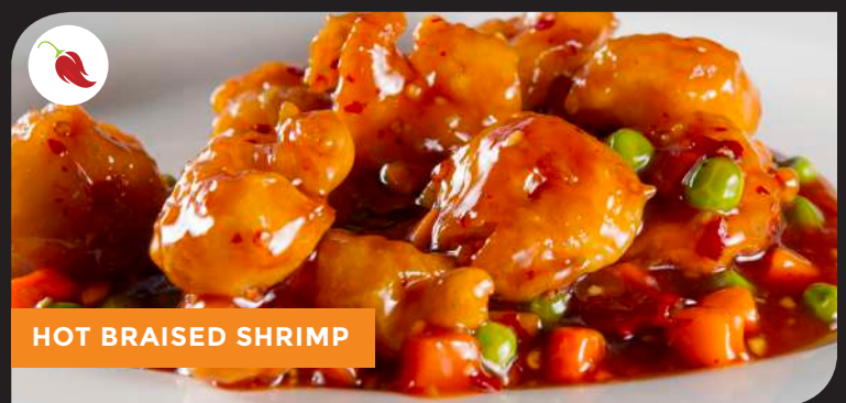
HOT BRAISED SHRIMP