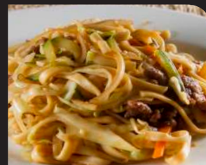
BEEF LO MEIN