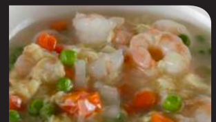
SHRIMP LOBSTER SAUCE