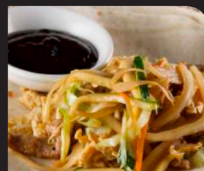
MOO SHU BEEF