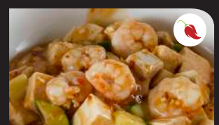
MA PO SHRIMP